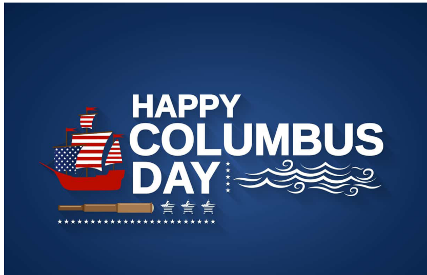
Columbus Day 14th